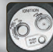
ONE PUSH CENTRAL LOCK SYSTEM