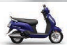
Pearl Suzuki Deep Blue No.2