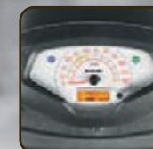
DIGITAL SPEEDOMETER TWIN TRIP METER SERVICE INDICATOR