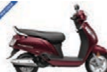
Metallic Matte Bordeaux Red