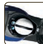
LARGE STORAGE SPACE