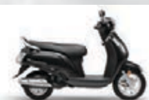
Glass Sparkle Black (YVB)