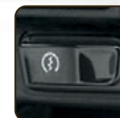
SUZUKI EASY START SYSTEM