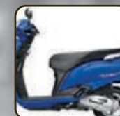
LONG SEAT & LONG FLOOR BOARD