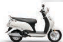
Pearl Mirage White