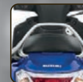
ALUMINIUM GRAB RAIL