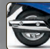
CHROME MUFFLER COVER