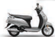
Metallic Matte Platinum Silver